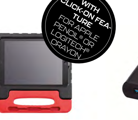
EDUCOVER®+ protective case incl. stylus holder

zip fastener with double zipper (lockable) I business card pocket (outside) I compartment for accessories inside I shoulder&carrying strap I10 padded compartments for tablets up to 12.9" I reinforced bottom and side panels part no. 5990861991